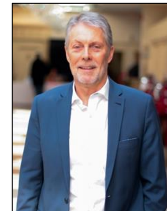
Fred Eisenberger Mayor